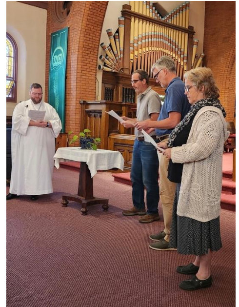
Three new members!